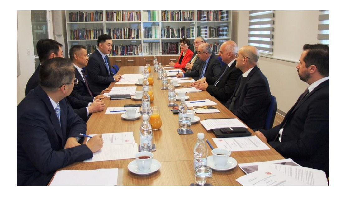
National Audit Office, Notre Dame Ravelin Floriana FRN 1601, Malta

Contact us | Privacy Policy | Disclamer | Accessibility Policy | Sitemap | Credits Copyright 2014, NAO, Malta